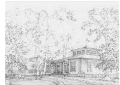
Kluge Estate Farm Shop